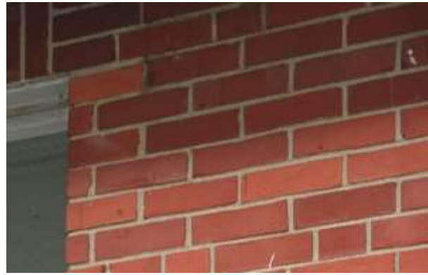
15. London Public Library – back of Children’s