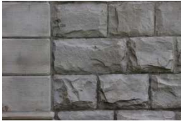
3. Madison County Courthouse