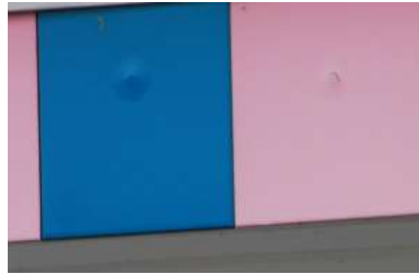
16. Terry Family Ice Cream Shoppe