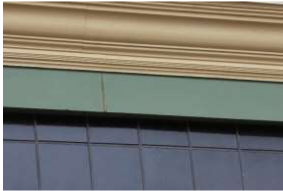
17. Wilson Printing