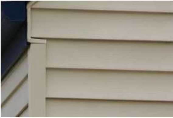
5. London Municipal Pool