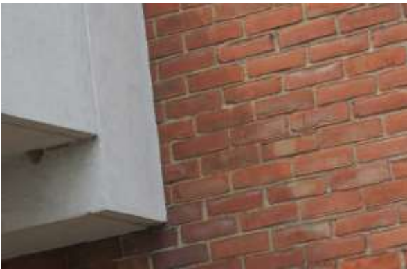
7. Madison Health Emergency Entrance