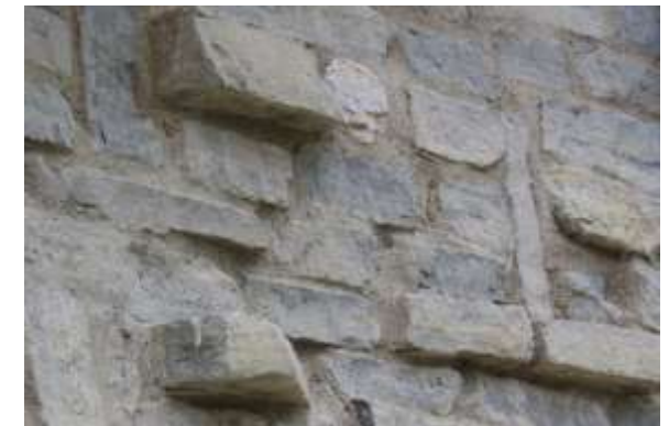
2. Shelter House at Cowling Park