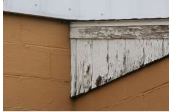
18. Madison Lanes