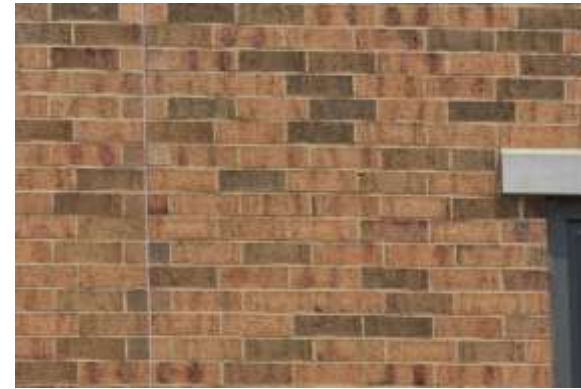
11. London Elementary School