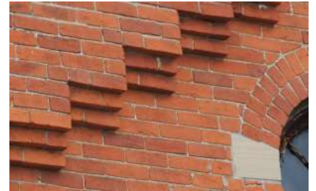
14. Madison County Sheriff's Office