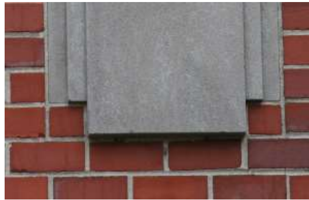
8. The Community Center