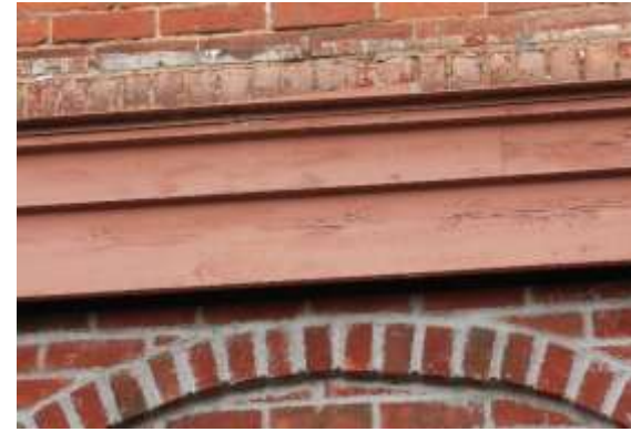
9. Dwyer Bros.