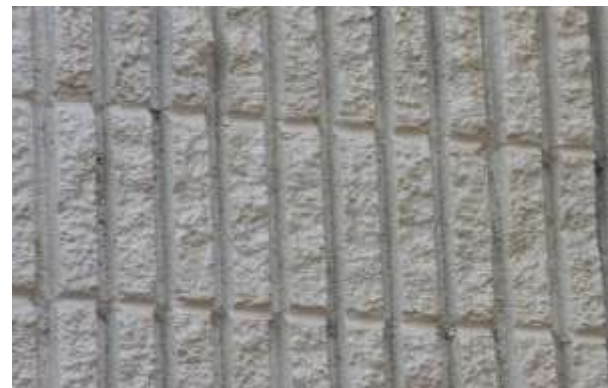
1. State Theater

Here are cropped pictures of buildings within the city limits of London. Take a walk. Take a drive. Check out your surroundings. Try to figure out the identity of each building. Write the name of the establishment under the picture. Every correct answer will enter your family in a drawing for a chance to win a Basic Family membership to COSI! 18 possible chances per family. You have until July 25 at 8 pm to enter. ONE ENTRY PER FAMILY