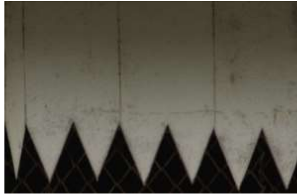
6. Madison County Fairgrounds Grandstand