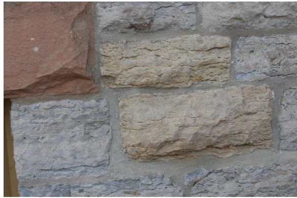
6. METHODIST CHURCH