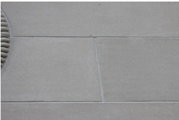
16. LONDON MIDDLE SCHOOL