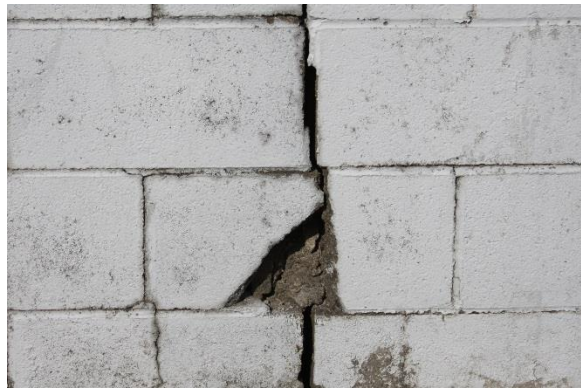
4. FAIRGROUNDS BATHROOM