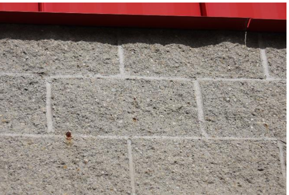
17. BUCKEYE CAR WASH