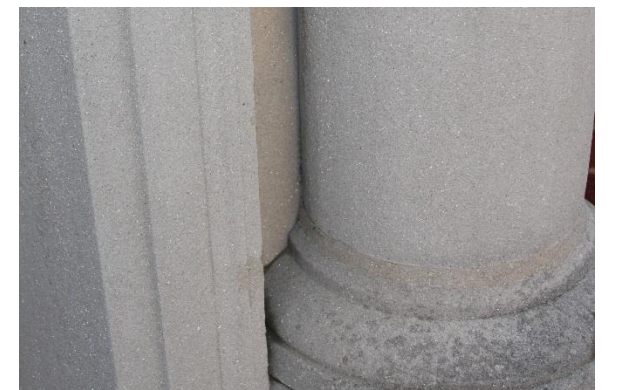
14. WATER DEPT.