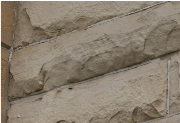
15. COURT HOUSE