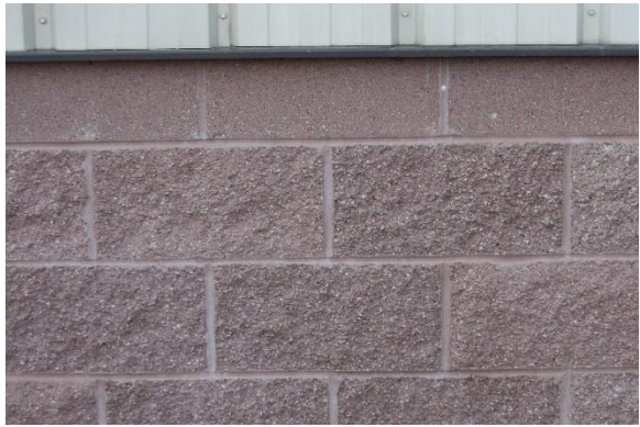
5. SENIOR CENTER