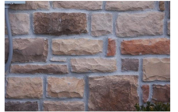
12. FAMILY DENTAL CARE