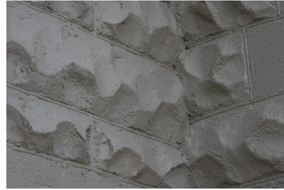
9. ST. PATRICK CHURCH