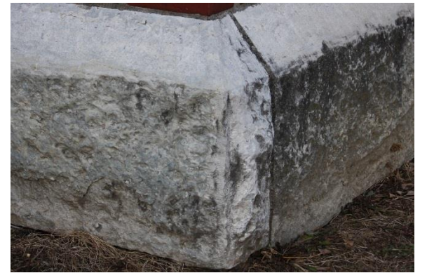
10. COMMUNITY CENTER