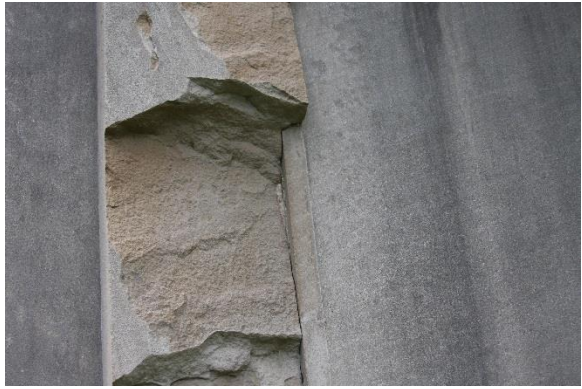
3. OAK HILL CEMETERY BUILDING