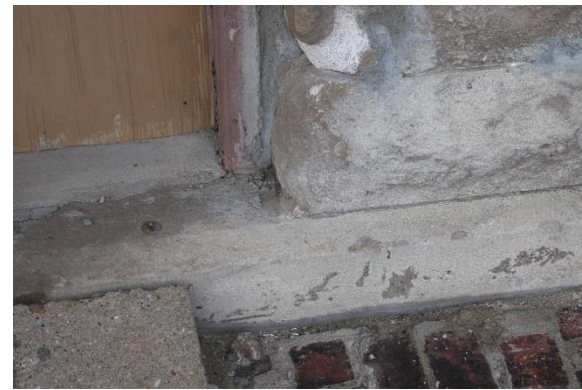
13. TRAIN DEPOT