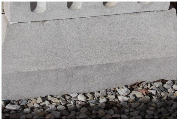
7. HUNTINGTON BANK